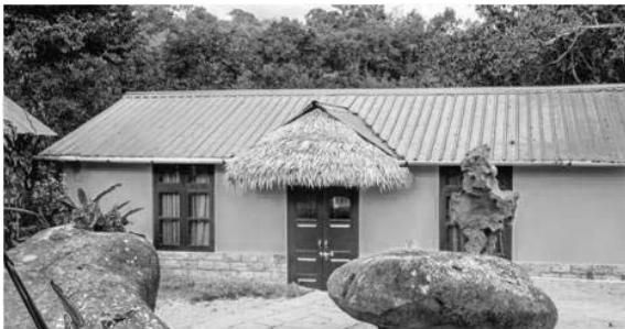
Fig.5: Poor imitation of the vernacular architecture, Source: Author

Poor emulation of the vernacular architecture is seen throughout the settlement. Some vernacular houses which were not able to take the pressure of overcrowding were quickly replaced with construction materials like G.I sheets, PVC pipes and concrete which does not require very frequent maintenance. As a result, the vernacular character of the settlement is drastically changing. There have also been several instances of overcrowding of the church premises which may in near future brew issues of vandalism and thus cause damage to the heritage structure.