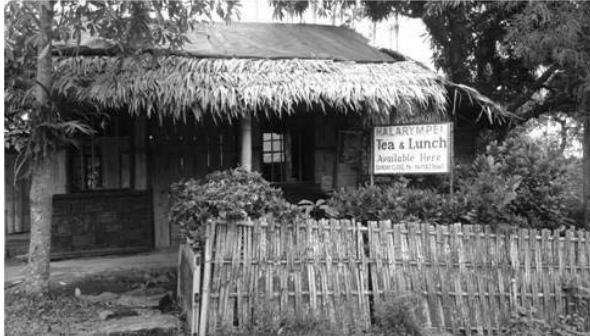
Fig.4: Residence converted to restaurant, Source: Bikram Aditya Nath

Due to the inflow of a large number of tourists to this settlement, most of the residences have converted the whole or at least part of their house to a restaurant or guesthouse.