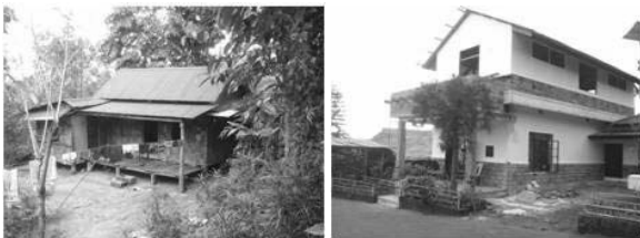
Fig.6: Change in the architectural character of the settlement

Cultural Heritage: Bamboo basket weaving and broom-stick making are the two traditional crafts of the settlement which have substantially reduced as people see more profit in selling other commercial products. Overall the traditional knowledge system of the use of locally available materials for craft and construction is slowly being lost.