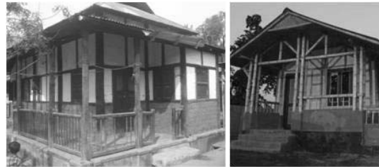
Fig.3: The vernacular architecture and its imitation in concrete

Also, several resorts and guest houses have been constructed which seem like a dire imitation of the rural vernacular architecture of the settlement. Influence of foreign cultures has also brought about changes in the traditional methods of construction. Ikra houses with sloping roofs have been replaced by concrete and glass flat roofed houses which are wrongly considered to be a symbol of status.