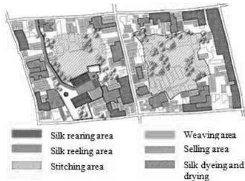
Fig 2: Functioning of a historic cluster, Source: Author

When we zoom in into a cluster, the planning of a traditional cluster becomes very evident. Each cluster functions as an individual unit which combines with other clusters to form a system. With reference to the Figure 2, it is clearly seen that the spaces for every activity related to silk weaving is clearly designated. Linear spaces along the roads are used for drying the silk yarn and the finished fabric. Whereas common open spaces bounded by two or more dwellings are used for silk reeling. The weaving of the silk takes place inside the house and the central space is used for silk rearing in the mulberry plants. The core of the overall area forms the market place where the finished products are sold.