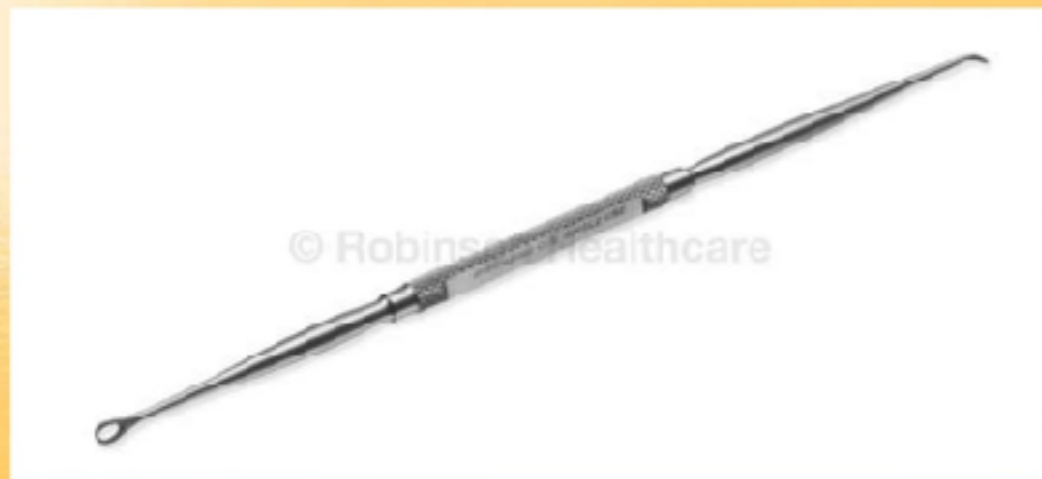
Formby cerumen hook and scoop