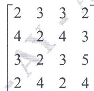
Fig. Q3 (a)